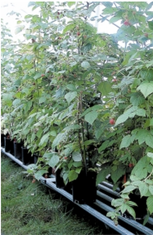
Raspberry canes in production in a polyethylene-covered greenhouse.

Spacing and arrangements of the pots in the greenhouse depend on management techniques, logistics and the size of the plants. Initially, plants may be kept pot to pot in single or double rows. Spacing with 20-