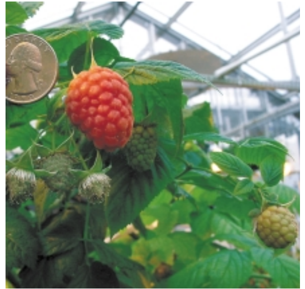
Size comparison of raspberries. Tulameen is a good variety for extended production with flowers at different stages.

cane plants. Bare-root long canes (3-4 feet) shipped during late fall or early spring from the Pacific Northwest already have the required cooling and can immediately be planted and forced into flower and berry production or alternatively kept in a cooler for later forcing. The long canes were planted in 3-gallon pots and evaluated for productivity and yield using similar management and production techniques as described for the multi-cane plants. Several single-cane plants in a larger container is another production strategy that may be evaluated. ♦