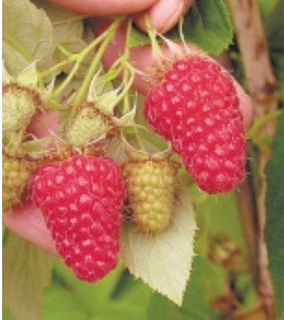
Tulameen berries are known for their size, color and productivity.

urticae ). Relative humidity is naturally low during Northern winter conditions, providing an ideal environment for spider mites. Control measures, including beneficials ( Phytoseiulus persimilis ), safer soap and sanitation, are used repeatedly to control and manage outbreaks. Good relative humidity also helps keep spider mites in check. Although infestations can be sustained to manageable levels through continuous monitoring and integration of pest control procedures, spider mite attacks are likely to be a continuous challenge and an obstacle in greenhouse raspberry production. Thrips and aphids are other potential pest problems. Although observed on plants in our trials, neither thrip nor aphid infestations have been severe. Biological control measures are available such as Amblyseius cucumeris for thrips and lacewing larvae for aphid control.